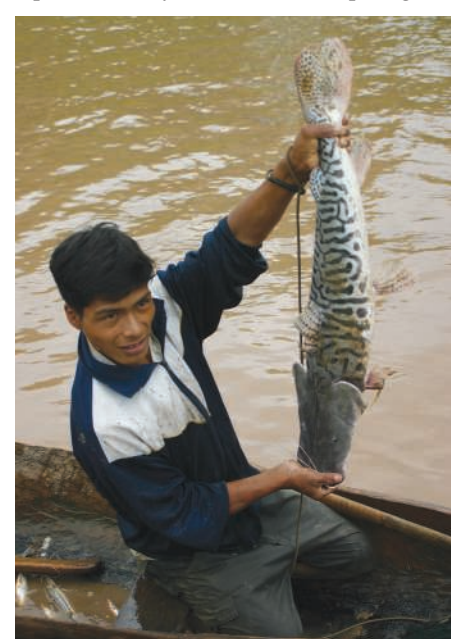
An Amazonian fisherman displaying a catfish for sale. Inverse GDP should not be used as an index of biodiversity because in poorer parts of the world economic development consistent with preservation of biodiversity must occur.

Plainly, the principal criticism of GDP stems from the fact that it amalgamates a variety of processes into a single figure. This will also be a problem with any single index we propose to monitor biodiversity; a possible way to reduce this criticism would be to develop a set of indicators attuned to different aspects of ecosystem health. Comparing the