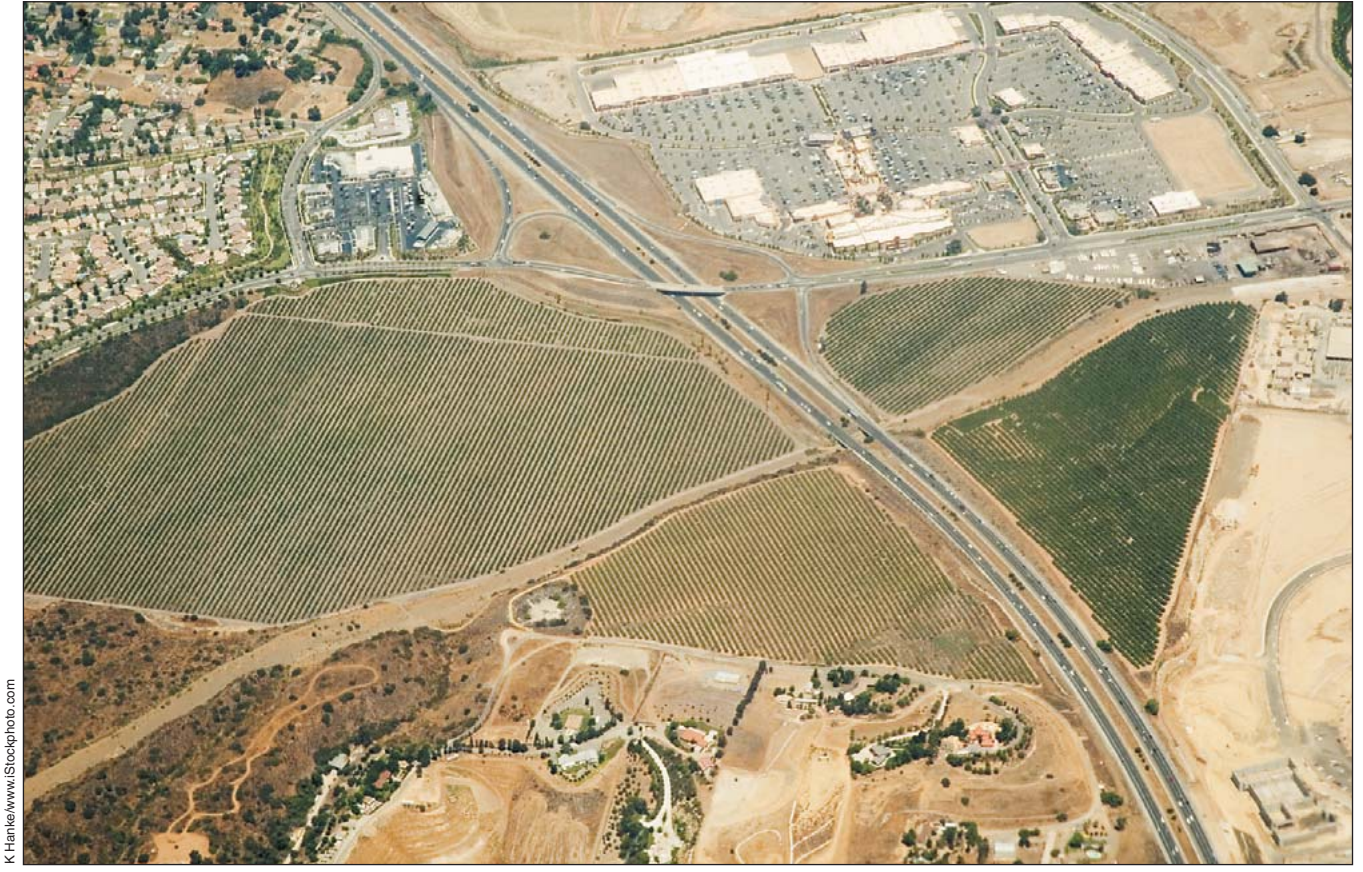
Figure 1. The ecological footprint is a measure of how consumption may affect the environment by taking account of food and fiber production, energy use, and human use of land for living space and other purposes.

(Dietz et al. in press). As a result, these hypotheses regarding population, affluence, age structure of the population, urbanization, the service economy, and biogeography must be treated as preliminary. Even so, we believe that testing them will be useful in furthering the discussion of anthropogenic environmental change.