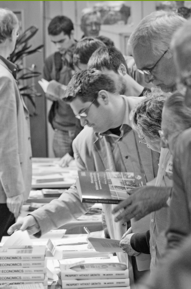
Participants browse the literature at the Leeds conference.

from page 2 ... • Very many congratulations on an excellent conference last Saturday. I really enjoyed it and came away inspired. I feel I made some good contacts and in some small part added my voice to the growing movement.